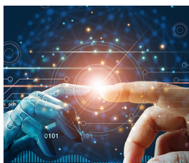
Emerging Technologies and Innovations