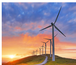
Sustainability and Environment