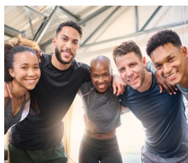
Health and Quality of Life