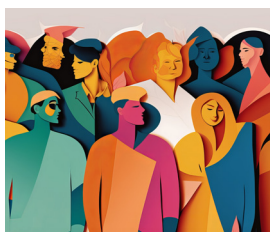
Community, Culture and Economic Resilience